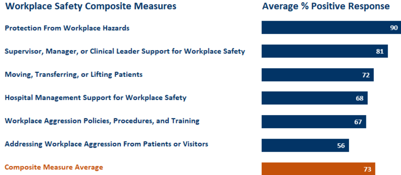
Chart 1. SOPS Workplace Safety Composite Measure Results Average Percent Positive Response – 2022 Updated Results